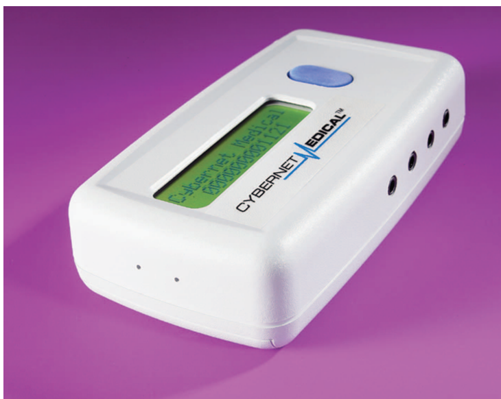
Cybernet Medical's MedStar™ Disease Management Data Collection System is an affordable, widely deployable solution for improving in-home-patient chronic disease management. The system's battery-powered and portable interface device collects physiological data from off-the-shelf instruments.

With statistics showing significant improvements in patient outcomes through closer in-home monitoring, Cybernet saw an opportunity to commercialize the physiological measurement and analysis technology. After completing its SBIR work with Johnson in 1998, Cybernet adapted the technology for its MedStar™ Disease Management Data Collection System, an affordable, widely deployable solution for improving in-home-patient chronic disease management. In July 2001, Cybernet Medical announced the general availability of the MedStar interface device and accompanying data collection server, together called the MedStar System.